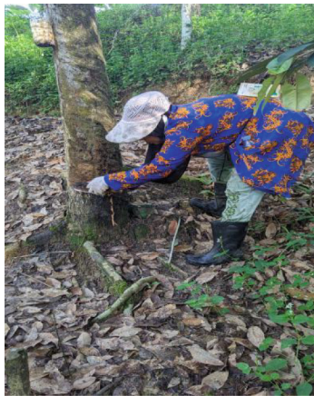
Fig. 3. Non-ergonomic work posture

Then in the agricultural vehicle aspect, there were 16.6% sub-sections that required repairs, such as adding traffic signs or warning signs on the road to avoid work accidents.