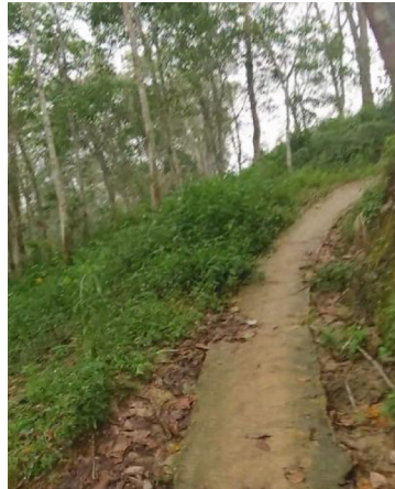
Fig. 4. Road bends without signs

Suggestions for improvement are to provide traffic signs or mirrors at road bends, so that vehicles from the opposite direction can be noticeable. This is not a priority to be repaired because there has never been an accident in CV. Eja Nursery. However, this situation needs to be improved because the vehicle from above cannot be seen from below if there is no help from a mirror at the corner of the road (Fig. 4).