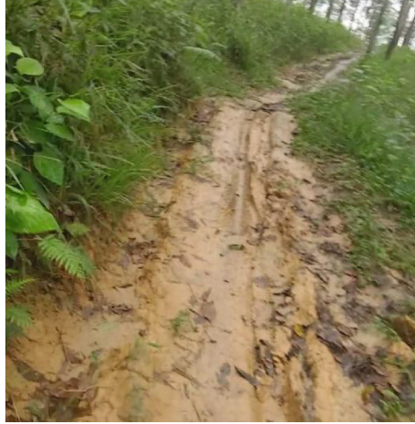
Fig. 2. Condition of Transportation Routes in CV.Eja Nursery

was found that there were 71% working posture of rubber farmers in CV. Eja Nursery was slightly harmful to the musculoskeletal system, then 21% working posture was very harmful to the musculoskeletal system. There were only 7% of safe work postures in CV. Eja Nursery [6]. Based on the results of these studies, it can be concluded that the majority of rubber farmers' work postures at CV. Eja Nursery was still not ergonomic. Therefore, it was necessary to change the working position in the workplace by providing small chairs for workers who tapped low tapping areas so that workers did not bend over too much and do not squat. Equipment to make the job easier was also needed, such as a trolley to transport rubber sap buckets to make them lighter (Fig. 3).