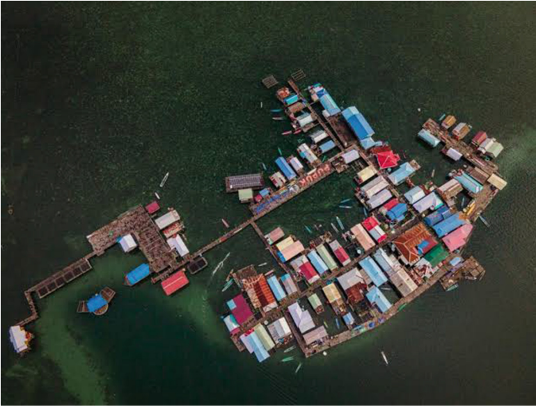
Fig. 1. The location of Mallahing Village which is above the sea