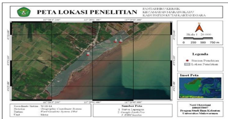
Fig. 1. KersikVillage Research Map

Mangrove canopy cover data were analyzed using the following formula: