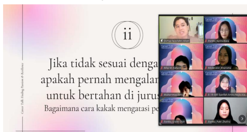
Figure 1. Documentation Material Delivery Session

We have invited several outstanding undergraduate students from the University of Mulawarman that have different majors and achievements. It differs from those who are going through internships and freelancing while actively studying as the University of Mulawarman undergraduate students. They have successfully elaborated their point of view of passion and resilience with the reality and experience they've gone through so far. This webinar was being hold on Saturday, May 14, 2022, at 10.00 WITA via Zoom Meeting.